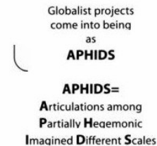
Figure 2. APHIDS. This acronym is both serious and a joke.

What's important about this comparison is how the advantages of universality became apparent to individuals: as an "inter-network" the Internet brought different technologies (with different functions) and different groups of people (with different goals) into a common space of communication and control. To join, these heterogeneous groups had to make a sacrifice to homogeneity and coordination, but in return they are connected to everyone else willing to make this same sacrifice and this is part of a shared imaginary which I have called a "recursive public" because of the way it is decided upon outside of direct state or corporate control. I think this might be akin to the notion of something being "partially hegemonic."